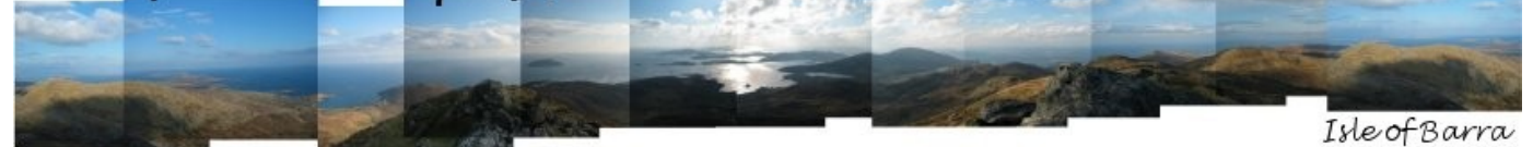
Isle of Barra